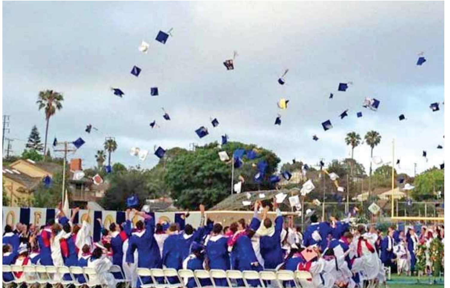
Graduates, at a local South Bay graduation, show their jubilation and throw their caps in the air in celebration of their milestone.